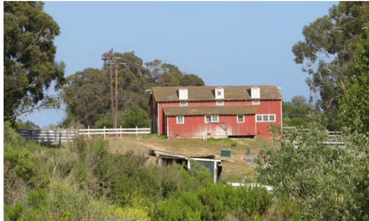
Campbell Barn as seen from Slough Road looking east. Camino Corto Open Space is beyond the white board fence.