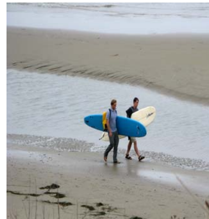
Left: The beach and bluffs from Coal Oil Point, looking east toward Isla Vista and the campus beyond. Right: surfers walking up the beach to where the best waves are.

Housing students in one of the most expensive real estate markets in the country is a challenge for the university. Santa Barbara County has allowed development to occur in several parcels adjacent to the campus, most notably Isla Vista, an unincorporated town directly west of the main campus. This very dense community of 18,000 residents is comprised of 95% rental housing, and the residents have a median age of 21 years old. Isla Vista School, an elementary school built by the Goleta School District, serves the children of Isla Vista and adjacent housing areas. This school borders our competition site. In addition to Isla Vista, the County also allowed a private developer to build two 10-story dormitory towers off campus. These dorms, Francisco Torres, are the tallest structures in the area, and visible from the competition site.