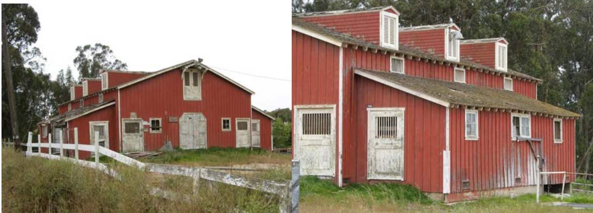
Left: Front or north side of the Barn, showing main entry doors. Right: Closer photograph of the west side of the barn. See the plans for dimensions and details. The flood light attached to the middle dormer will be removed when the exterior renovation is completed.

The original drawings of the barn show a main building with 5 bays, the center aisle for hay storage flanked by two rows of stalls for the animals, and access aisles on the outer side of the stalls. The lean-to structures on the sides of the barn enclosed a separate stall for sick animals, a kitchen, 2 box stalls, and a harness room.