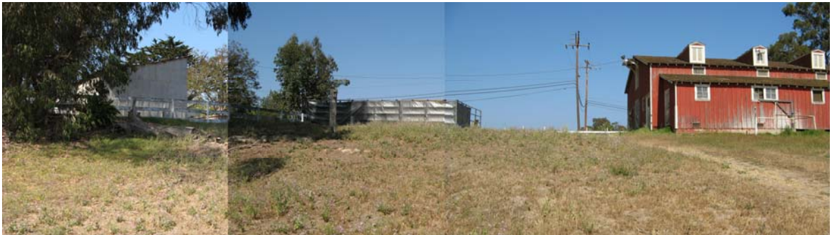
Site Photo 5. This photo is taken from location 5 on the aerial photograph give a better view of the hay storage enclosure, and the board fence on the north of the site. Note that the wide angle setting used in this photograph tends to exaggerate the steepness of the hill.

Two residences will have a minimum of 1 bedroom and the third should have a minimum of 2 bedrooms. Bedrooms should be sized for at least two students, so that a 1 bedroom unit will house a minimum of two students. The residences should be townhouse style with their main entrance on the east, uphill, or plaza side. Since no food service is available nearby, the kitchen and dining areas of these residences should be sized for full cooking capabilities.