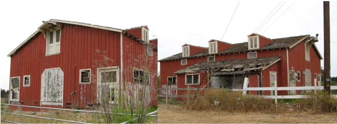
Left: The south or back side of the barn. Right: the east side of the Barn. This side has the most damage to the structure, with the exterior wall of the Sick Stall partially collapsed. The roof is degraded in this area, and the chimney is no longer standing. Repairs to the exterior of the building are not in the scope of this competition.

The Barn's status as a potential Landmark Building requires that its exterior construction, color, and finish not be modified. All the existing doors and windows must be maintained and re-used as much as possible. All changes to the building required by the adaptive re-use must be on the interior. In order to be as sustainable as possible, students are encouraged to re-use the interior structure of the barn. Part of the intention of using the Barn as display space is also to display the inside of the barn as it was when it was in use. Thus, retaining the open rafters, the three aisle ways, and the stall construction is desirable when adapting the barn. The lofts that were built over the stall areas were probably accessed by a wood ladder and were most likely used to store hay and additional feed. The program does not require that visitors access these lofts, however if the designers choose to make the lofts part of the display function, then disabled access must be provided by adding either an elevator or a ramp. As this would constitute a significant change to the barn construction, entrants are discouraged from using the barn lofts for a public function. The repair of the barn exterior is not part of the scope of the Competition. Students may assume that the exterior and the roof have been fully restored back to their original condition.