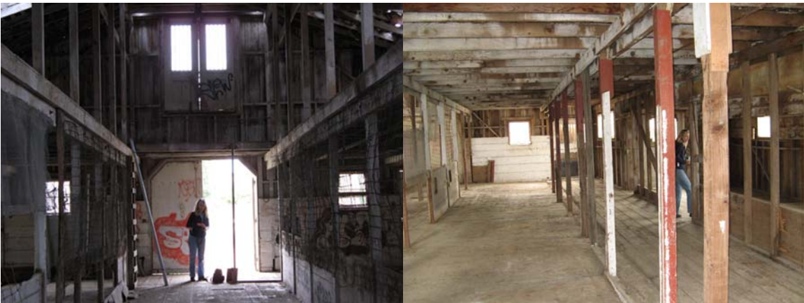
Left: Interior of the barn, looking north. Note the stalls on the ground level and the partial lofts above. The high doors were used for ventilation and for bringing in hay to the lofts over the stall areas. Right: Looking south along the west side stalls with the "Runway" or exterior access aisle on the right. Note that the interior partitions that would normally enclose the stalls have been removed over the years.

The Barn's status as a potential Landmark Building requires that its exterior construction, color, and finish not be modified. All the existing doors and windows must be maintained and re-used as much as possible. All changes to the building required by the adaptive re-use must be on the interior. In order to be as sustainable as possible, students are encouraged to re-use the interior structure of the barn. Part of the intention of using the Barn as display space is also to display the inside of the barn as it was when it was in use. Thus, retaining the open rafters, the three aisle ways, and the stall construction is desirable when adapting the barn. The lofts that were built over the stall areas were probably accessed by a wood ladder and were most likely used to store hay and additional feed. The program does not require that visitors access these lofts, however if the designers choose to make the lofts part of the display function, then disabled access must be provided by adding either an elevator or a ramp. As this would constitute a significant change to the barn construction, entrants are discouraged from using the barn lofts for a public function. The repair of the barn exterior is not part of the scope of the Competition. Students may assume that the exterior and the roof have been fully restored back to their original condition.