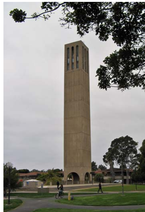
Left: Central UCB Campus with its interconnecting network of bike paths and walkways. Right: Storke Tower, the central campus landmark.

The university consists of 17,000 undergraduate students, 95% of whom are from California, 3,000 graduate students and approximately 1,000 faculty members. The university offers approximately 200 majors and degrees to their students. In an acknowledgement of its location, Santa Barbara weather is featured prominently on the university web page, and links to updated surfing conditions are not difficult to find.