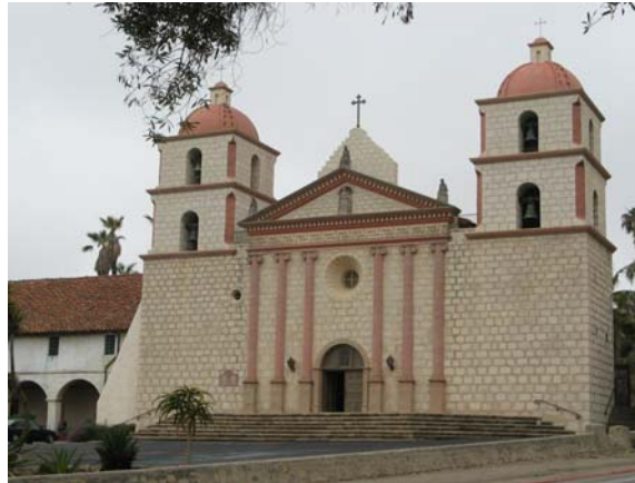
Front façade of Mission Santa Barbara. The two towers are unusual for California Missions. Note the Adobe arcaded building on the left.

The Mission Santa Barbara has survived to the present, and unlike many other California Missions, has remained a functioning parish since its founding. The stone building was damaged in two earthquakes: 1812 and 1925. It was enlarged and rebuilt after the first quake, and rebuilt and restored to its original appearance after the second earthquake.