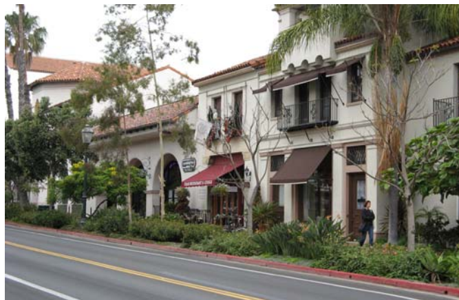
A section of State Street in downtown Santa Barbara showing the Spanish Mediterranean Revival Style Architecture. This style gives the area a charming feel.

After suffering extensive damage in the same 1925 earthquake that destroyed the mission, city business owners decided to rebuild their downtown entirely in the Spanish Mediterranean Style. This revival style was very popular at the time for residential structures, but was not commonly used in commercial construction. These guidelines have remained in force downtown to this day, resulting in a uniquely-styled downtown business district.