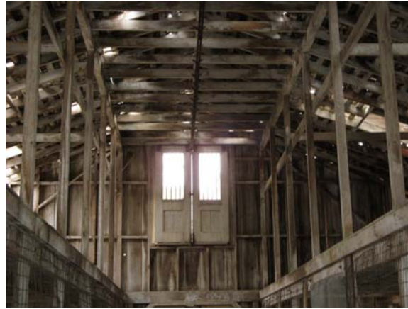
Looking south toward the rafters and hay lofts above the stalls. The roof framing is similar, but not entirely consistent with that shown in the cross sectional drawings.

Any discrepancies between the photos of the barn and the drawings of the barn will be disregarded. In the case of major discrepancies, students are to use the design and dimensions shown in the drawings.