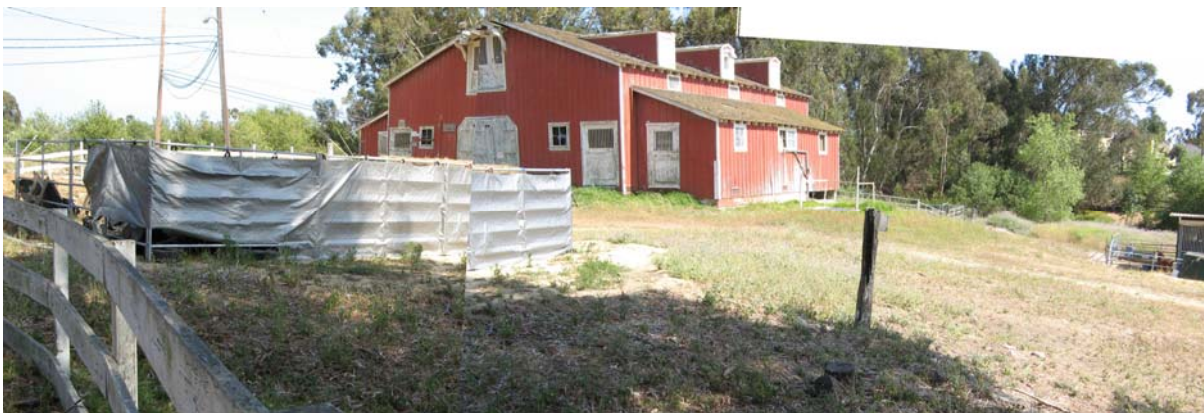
Site Photo 4: This photo, taken at location 4, shows the Challenge 2 site. Note that the round exercise ring in the aerial photograph is no longer present and has been replaced by a fenced hay storage area. This area is partially covered by a gray tarp. Note the slope of the site in a westerly direction. Entrants are to use the site section in the Competition Site Plan AutoCAD file to determine the slope of the site.

See the Submission Requirements Section for a description of the required drawings, exercises, and presentation formats.