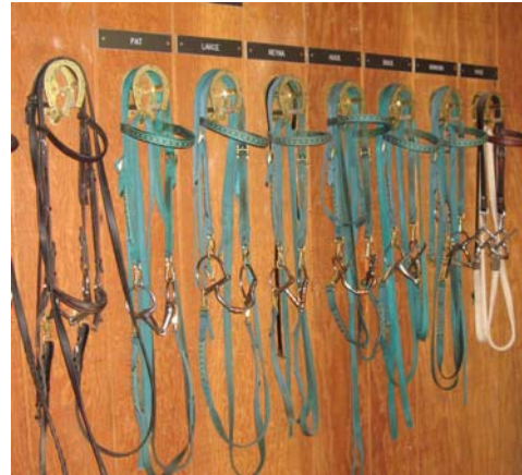
Left: Saddle racks in a shared tack room. The 4x4 posts are mounted perpendicular to the wall to allow air to circulate around the saddles. Some of these saddles are hanging on metal bars. Right: Bridle racks on a wall. Simple wood pegs 3 inches long and 12 inches on center are acceptable to hang bridles.

In addition the residence building should have one office for the administration of the Equestrian Team. This office should have an exterior entrance, either on the east or west side of the complex, and be approximately 150 sf.