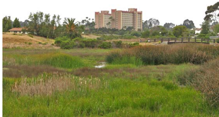
Francisco Torres Dormitory towers photographed from Los Carneros Road. Note the marshy creek in the foreground, typical of the coastal mesa area. These towers are the tallest buildings in the West Campus Area.

Housing students in one of the most expensive real estate markets in the country is a challenge for the university. Santa Barbara County has allowed development to occur in several parcels adjacent to the campus, most notably Isla Vista, an unincorporated town directly west of the main campus. This very dense community of 18,000 residents is comprised of 95% rental housing, and the residents have a median age of 21 years old. Isla Vista School, an elementary school built by the Goleta School District, serves the children of Isla Vista and adjacent housing areas. This school borders our competition site. In addition to Isla Vista, the County also allowed a private developer to build two 10-story dormitory towers off campus. These dorms, Francisco Torres, are the tallest structures in the area, and visible from the competition site.