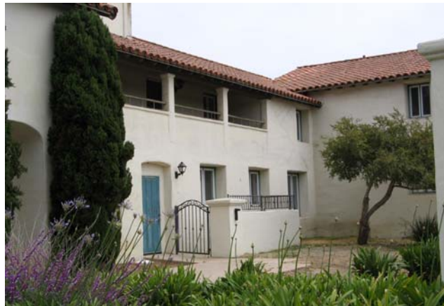
The courtyard of the old Campbell House. It was built in the 1920s in a Spanish or Mission Revival Style. The Devereux School used this building as their main administrative building.