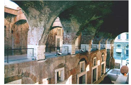
3. Individual shops, a key aspect of The Urban Market

redevelopment program”, 5 is one of the best examples of such a market. As the archetypal consumer complex, the experience of Trajan’s Market was one of multi-level, dense urban activity that went beyond being a basic house for the exchange of goods and became a direct contributor to the social fabric of ancient Rome. The arrangement of the stalls was conceived as a multi-level stacked layout, (6 floors of shops and offices) connecting to a central arcaded passageway which stepped down to an external court. The entire complex was semi-circular in form, surrounding the court and was directly adjacent to one of the principle forums of ancient Rome. The basic shape and stacked levels made the entire form conceivable from almost anywhere in the building and provided innumerable views from which to oversee the activities and hustle bustle of the market. It is easy to imagine how the energy of the merchants, the aroma of the colourful goods and the sounds of exchange that would have combined to make it an intense sensory experience. The provision of permanent and linear rows of merchant stalls confirm the market to be a fixed artifact within the urban fabric of ancient Rome, further enhanced by its direct connection to the other principle social spaces, the forae.