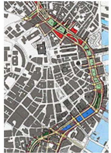
1. The Fitzgerald Expressway A rift in Boston's urban fabric