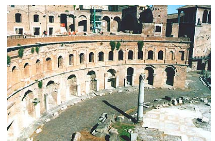
2. Trajan's Market, Rome The strong form of the archetype

A successful Urban Market will actually become an urban artifact and destination for other activities, as it will encourage many levels of social interaction and cultural exchange. It can be argued that the architecture of the marketplace plays a direct role in this development through the basic layout of form, and circulation. Trajan's Market in Rome, “planned as (an) integral part of an urban