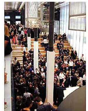
8. Prada Store, New York Urban Destination

With the proposal for a new food market for Boston, it was essential to revisit the principles of the Urban Market. The site was chosen for the Boston Market with careful attention to its immediate surroundings. With an existing market at the north end of the proposed greenway, the Quincy Market, a secondary market book-ending the southern end of the site was appropriate. This would create a gateway to the area at each end of the corridor and allow the new market to integrate with existing urban networks such as the nearby South Station transit hub. The market, and by extension the