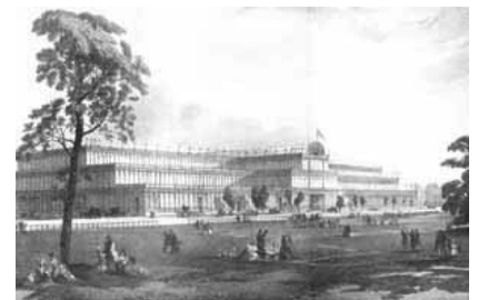
4. Crystal Palace, London

Another historically significant marketplace that implemented the same fundamentals as Trajan’s Market was the Crystal Palace in London, England. As the site of the Great Exhibition of 1851, the building was simultaneously a market