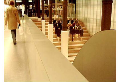
7. Prada Store, New York The ‘Wave’

experience” 9 . The creation of ‘the wave’, a fluid wooden sculptural display element centrally located in the store, attempts to introduce a more dynamic and engaging consumer experience. With one continuous sweeping material, the customers and interspersed mannequins cascade up and down through the store next to an elevated walkway. A shopper’s sensory experience of the space changes dramatically while moving through it. The shape and form of the wave allow not only for multi-level merchandise display and customer interaction but also for public events on the stepped levels and stage-like spaces—thus rendering the store an urban destination. Although deemed revolutionary at the time of its debut, it is easy to determine that its historical precedent lies in the successful urban space of Trajans Market, in Rome. By trying to invent a new consumer experience for the Prada store it would appear that Koolhaas is actually returning shopping to an abstracted form of its original typology.