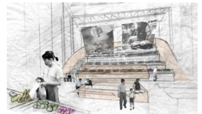
9. Proposed Boston Market Dynamic Engagement