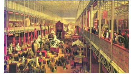
5. Interior of Crystal Palace Simultaneous engagement

for the display of the wealth of the British Empire, and an important cultural destination. The Crystal Palace “marked a pivotal instance in the history of public spectacle, mass gathering, tourism, and trade...as an event, the exhibition was unparalleled; as an incased landscape, the Crystal Palace provided a new form capable of absorbing unprecedented urban congestion.” 6 It was a multi-storey, glass and steel structure, containing exhibits set out in a regular and modular format which centered around a massive interior atrium space. From any point within the Palace one was afforded a dynamic and engaging view of the people and ‘merchandise’ within the structure (nothing was actually for sale). Like Trajan’s Market, The Palace set out to be a site solely for the exchange and display of goods, the commodity in this case being information, but because of the strength of the typological form it became something much more important. The marketplace became the key node of social interaction and information exchange for Victorian London. The visionary of this project utilized the key aspects of the Urban Market typology with great success. As John Hancock points out, “the works of the past always influence us, whether or not we care to admit it”. 7 In this case, the similarities that tie both markets back to the typology are evident, and the varying differences are noted to be in the architectural form.