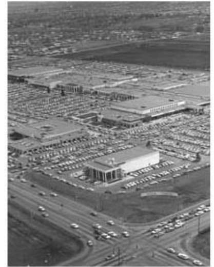
6. Suburban shopping sprawl the antithesis of the Urban Market

Influential designer and arbiter of popular culture, Rem Koolhaas revisited the typology when he challenged the traditional individual shop with his Flagship Prada Store in Soho, by “investigating ways to reinvent the retail