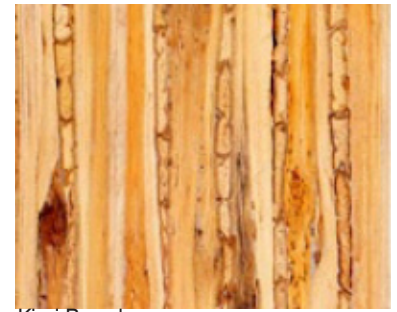
Kirei Board www.kireiusa.com