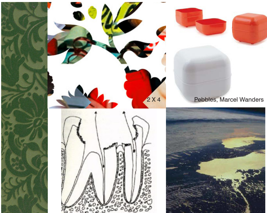
Pebbles, Marcel Wanders

Courtesy of present-day technology, images of all sorts have been reproduced and distributed with unprecedented accessibility to the public. Access to the 'past' is simple and convenient. Precedence for invention will continue to become more varied and more significant, relying far more on individual preference than financial or social means. "The plurality of precedents necessitates the establishment of a framework for choice so that intentions may be understood and expressed in a coherent design proposal...It should, by the hierarchies that it establishes, be an affirmation of basic personal values so that the result is authentic, reflecting the motivation of the author as well as the contingencies of fact and reality. Most of all, it should be based on convictions, for without conviction, the architect is unable to work." (Editorial, 63)