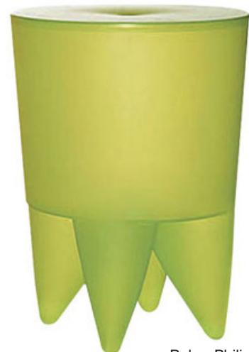
Bubu, Philippe Starck