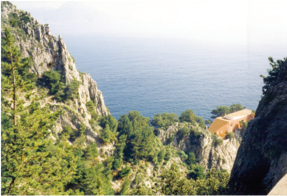
Villa Malaparte and its precarious position.

landscape while at the same time being a piece of it.