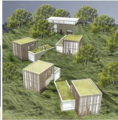
La Reunion with similar rooftop lookouts.

Casa Tolo, a house in Portugal by Alvaro Leite Siza Vieira, is a more recent example of a modern house integrating itself into the landscape and responding to its natural setting. In the case of Casa Tolo, the building doesn't just negotiate the contours of the site like Villa Malaparte does, but it in fact becomes a part of the site and measures the contours and drop in elevation on the site along itself. Again, there are the stairs, in Casa Tolo's case, both internal and external that act as a passage down the hilly site. Again, there is the occupation of the roof element, and having that become a landscape feature. This project, as a precedent, informed the relationship with the terrain, the form and simple materiality of concrete. The Dallas site, with its steep escarpment, benefited from dealing with the siting the same way Casa Tolo does. In the Dallas project, like Casa Tolo, the living units are used as stepping stones embedded into the hillside like stairs. The concrete is used to act as a retaining wall, and the end that sticks out the hillside is completely glazed. The living units are then designed so that the living and dining section of the unit are by the glazed front while the bathroom and kitchen are put back towards the back of the unit where natural sunlight isn't as necessary. The proto-type for this living unit is taken from basic small studio-unit space planning from a typical condo.