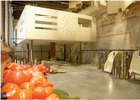
DrMM's Naked House.

Another aspect of the studio unit is the pre-fabricated wood panel cladding. The exterior is imagined as pre-fabricated recycled wood panels that can be custom cut to contain any variety of designs. The firm drMM used a pre-fab wood panel system for their project “Naked house”. Computer drawings are used and large saws cut through the large wood panels much like a laser printer would work cutting through much smaller pieces. These panels are then easily installed on site. The idea of the pre-fab custom wood panels is that they would act as a screen to block a deal of direct sunlight. A competition could be held so that artists and designers could design the patterns that would be cut into the pre-fab panels. This would help with both self-promotion of the La Reunion Artists group, but also would help foster a community of artists, both locally and potentially even internationally.