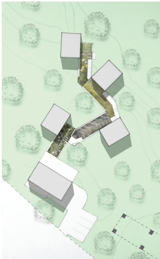
Site plan of La Reunion with "sprawling" character of buildings.

From a typology standpoint, this project is a kind of hybrid. Each unit is imagined as a combination of two modules, a living unit and a studio unit. The combination live/work unit is part housing, and part artist studio. The idea of a live/work unit is not any sort of a new idea and the idea of one placed in nature also has its precedents. The Schindler House in Southern California is a classic modern example of a housing-type modified to contain a working studio. The Schindler House was built so that the studio and living spaces include large windows that open out onto the beautiful southern