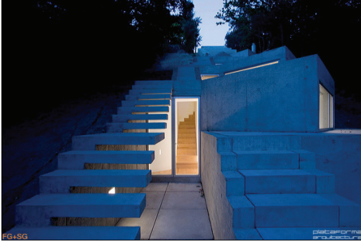
View up Casa Tolo.