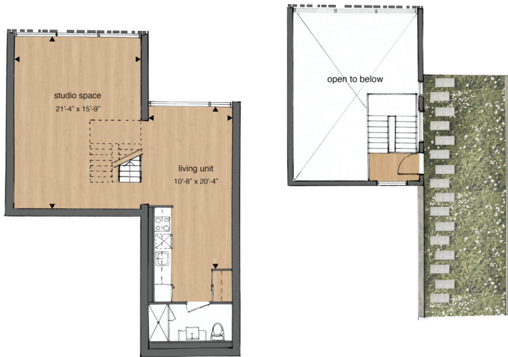
Typical plans of live/work modules for La Reunion

The studio module in the Dallas project contains a connector unit. The studio is a cube shape rather than a rectangle so that it is a double-height workspace. The space needs to be flexible to account for the fact that any variety of artists working in any type of medium may end up using the space. The double-height space is also important so that it can connect the entrance plane (the roof plane) down to the living/work plane of the unit. Since direct lighting can be distracting and damaging to certain art pieces the studio module does not have any windows on the east, west or south facades keeping out any direct light. The north face is entirely glazed but since it isn't a perfect north it also has a wood screen placed on the exterior to block a certain amount of direct sun.