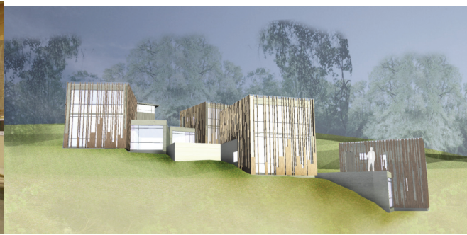
Similar Pre-fab recycled wood panels on La Reunion

With regards to sustainability, there are some concerns about tearing up an undeveloped natural setting and placing such a large footprint down the face of the escarpment, however there are benefits to this plan that may offset those concerns. The large footprint is comprised almost entirely of green roof systems that aim to carry indigenous plant species and one day become fully integrated into an ecosystem that has been over-run by foreign grasses. Also, the thick walls and placement of the buildings in the hillside would lead to good insulation numbers and low energy heating and cooling. While water run-off would need to be studied further, there is a pond at the bottom of the site that could potentially take storm drainage and return it to the environment.