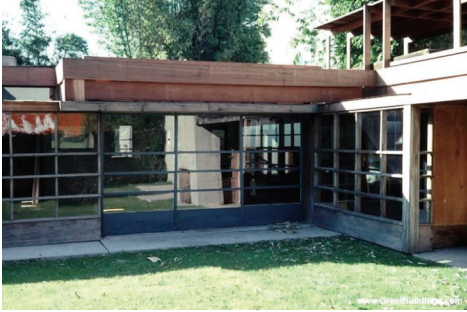
Schindler House in Los Angeles

California terrain. The landscape can then act as an inspiration to the artists working in the studio. The Dallas project also uses the natural landscape as an inspiration piece. Both the studio and living unit module are solid on all three sides with the north wall composed of floor to ceiling windows that face down the hill and look out onto the site. This also has the added benefit of only allowing north indirect light into the space.