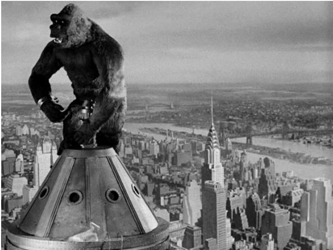
Fig 2: King Kong (1933) Although quite advanced for the time, the techniques used to both animate and superimpose King Kong against the New York skyline in 1933 leave the viewer knowing that special effects have been employed.

The 1933 version of King Kong brought the model based image of the Empire State Building, then the tallest structure in the world, to the forefront of the public eye, through the establishing shots created for the film. The movie role of the building was close in significance to that of the giant ape or Fay Wray. In the 2005 Peter Jackson remake of the film, the CGI version of the aerial view of New York City offers a super realistic and somewhat uncanny recall of the state of the city in 1933, and continues to allow the identifiable architecture of the Empire State Building to take a dominant role in the film cast.