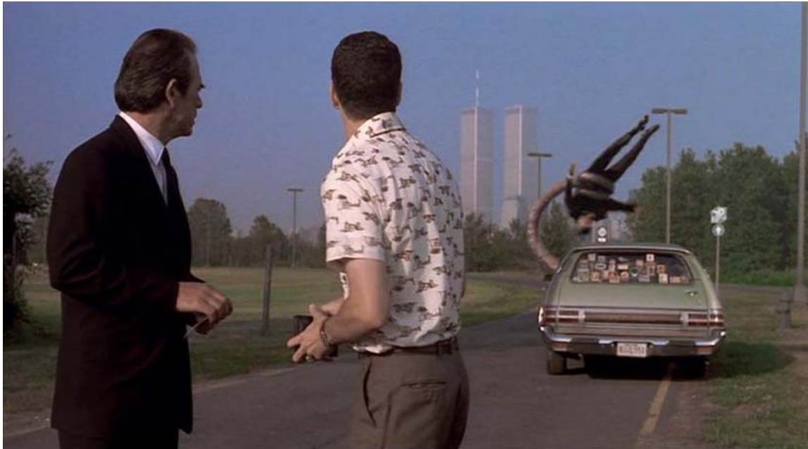
Fig 5: Men In Black (1997) The World Trade Towers form an establishing backdrop behind a comedic scene in Men In Black

Where the inclusion of live footage of the World Trade Towers in the New York skyline pre 9/11 had been used to proudly symbolize a modern New York, one that had ultimately escaped the overriding nostalgic influence of Hugh Ferriss, post 9/11 resulted in a different appreciation of the Twin Towers as they could no longer be viewed casually. The event resulted in a strained relationship between viewers and the New York skyline. Much of this had to do with the obvious void in the new skyline. To catch glimpses of the towers employed as mere "city identity backdrops" in earlier films such as Men In Black (1997), positioned a tragic element in a comedic view that to this day can elicit feelings of anxiety or guilt. In reaction, directors have taken varying approaches to dealing with this potentially sensitive issue.