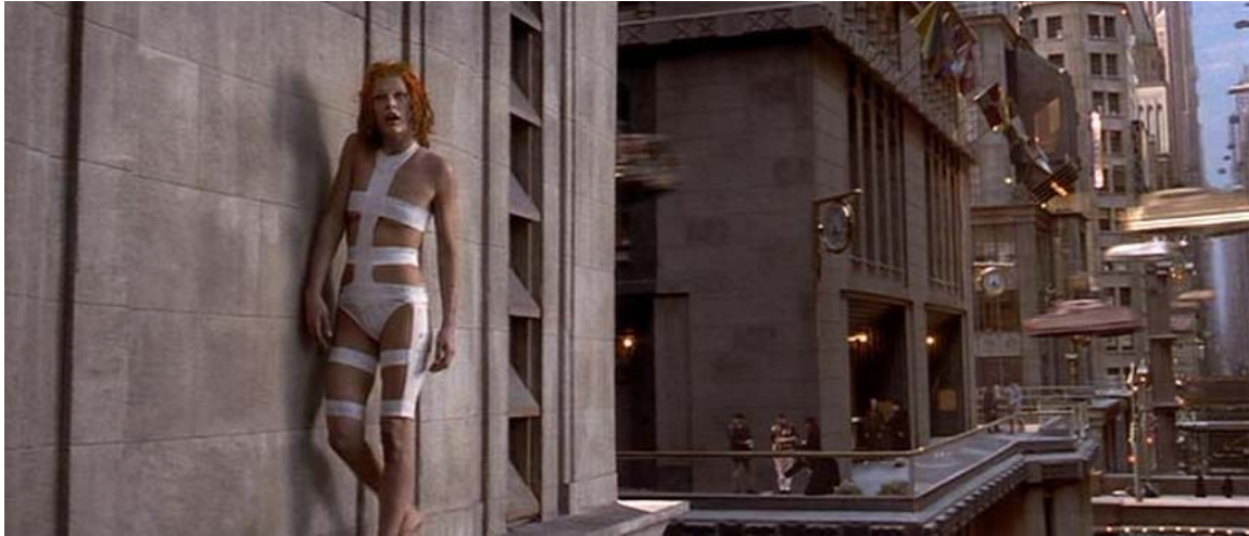
Fig 11: The Fifth Element (1997) Leeloo walks along a projecting stone ledge in The Fifth Element