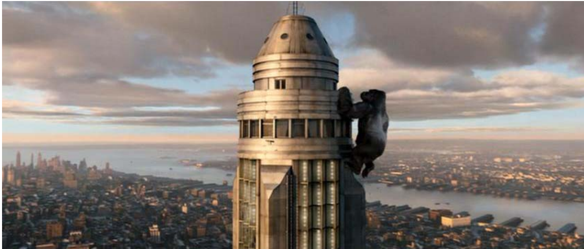
Fig 10: King Kong (2005) King Kong climbs to the top of the Empire State Building, making physical use of the detail provided by the architectural style of the period.

"New York City is vast," stated Letteri. "We knew it would be impossible to build every building, so we researched into what the city was like in 1933, used original blueprints of landmark buildings, like the Empire State Building and the Chrysler Building, then picked city views that were key to the story and built around those landmarks." 34