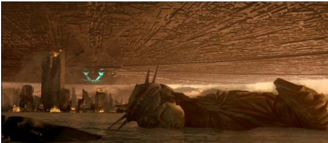
Fig 4: Independence Day (1996) The Statue of Liberty and the World Trade Towers as illustrated in the destruction of New York by aliens in Independence Day .

9/11 changed everything. Disaster films that were scheduled for release were put on hold due to their now sensitive subject matters. Arnold Schwarzenegger's terrorist-themed action film Collateral Damage , and Martin Scorsese's Gangs of New York had their releases delayed. Jackie Chan's Nosebleed , about a plot to blow up the World Trade Center was dropped entirely. 28 The film industry stepped back to reassess violent content and the depiction of New York architecture in film. Externally imposed censorship to this point had developed with respect to nudity, violence and language in the representations of people in film, but had never dealt with buildings.