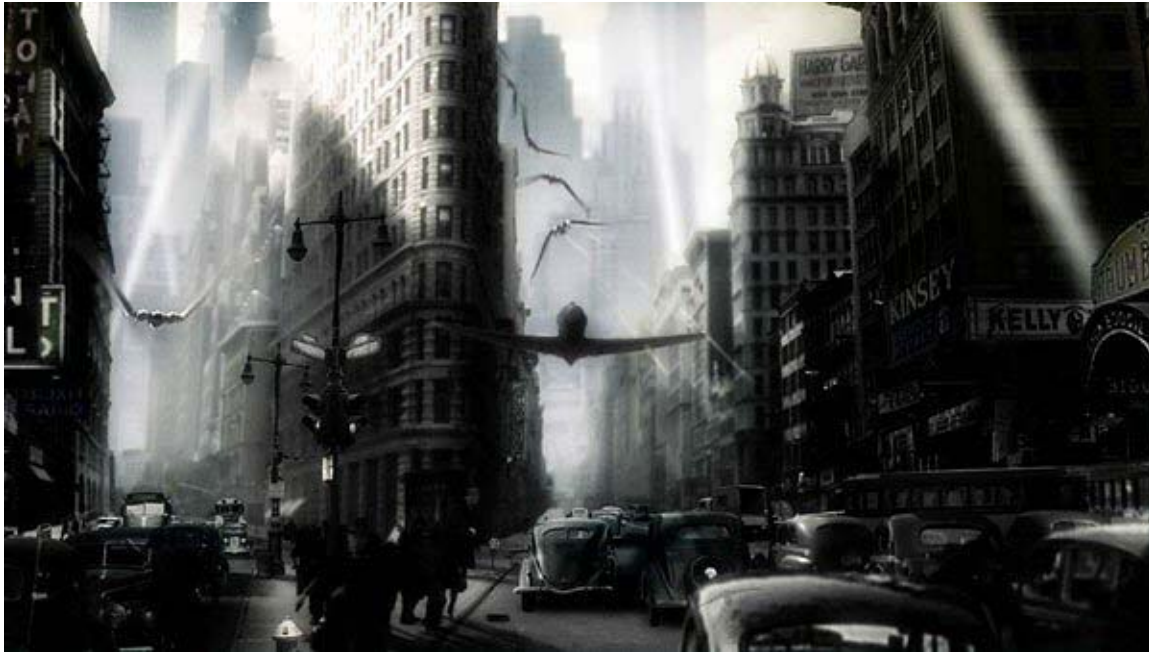
Fig 9: Sky Captain and the World of Tomorrow (2004) The Flatiron Building provides the immediate setting for Sky Captain , with shadows of the skyscrapers hovering in the background.

Conran also employs a pseudo sepia tone as well to create a highly stylized, nostalgic version of the city. At one point in production the film was also to have an aged "grain" applied, but tests proved it too distracting so this was abandoned. 32 They did, however, freely move the images and ghostlike silhouettes of the Empire State Building around the setting, to better position them for the scene – much like characters in a photo shoot. Iconic images of New York architecture of the period in the "establishing shots" were central to the understanding of the context.