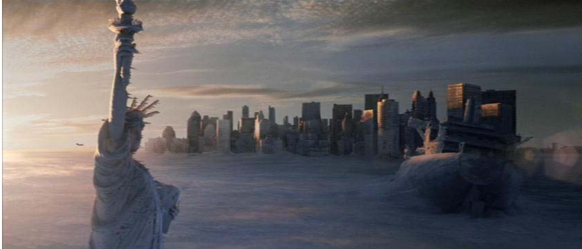
Fig 8: The Day After Tomorrow (2004) The CGI view of the frozen New York skyline, featuring the Statue of Liberty.

Lidar based CG which used a customized laser scan to digitally scan the forms and details of the city. The impetus was to make the ice covered buildings look in scale and not as if they were miniatures or CG – a problem when the normal brick, glass and stone textures were to be replaced by ice. The composite ending shot of the film consisted of more than 300 layers. 30