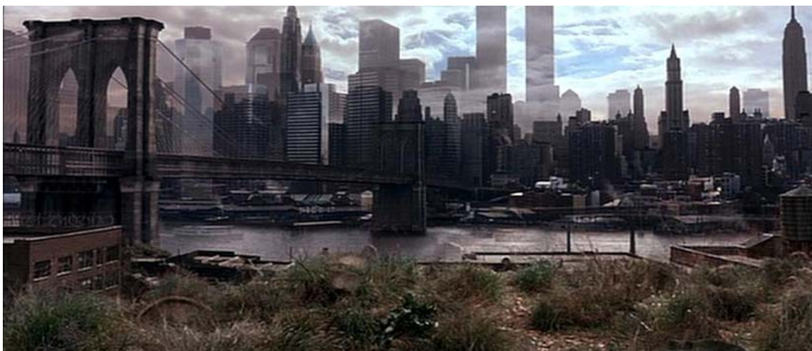
Fig 6: Gangs of New York (2002) In Gangs of New York the 1863 skyline fades into a pre 2001 version that includes the World Trade Towers along with other iconic elements of the 20 th century.