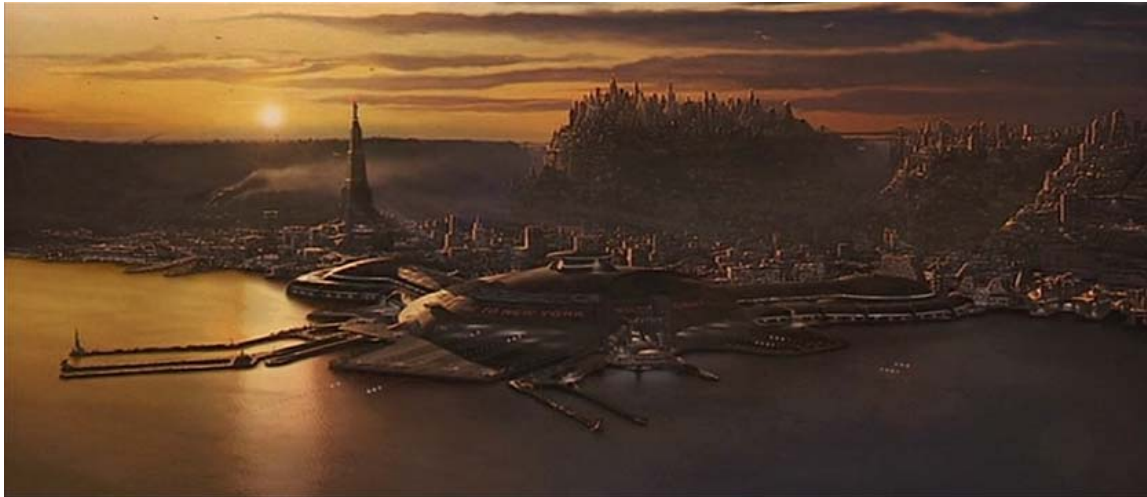
Fig 3: The Fifth Element (1997) Jean-Claude Mézières' New York skyline for The Fifth Element .

town where there is a clear vertical hierarchy created that somewhat parallel's Lang's Metropolis , with the exception that it occurs entirely above grade. The upper portion of the towers represent good and light. The mid section is used for day to day living, and the ground level is devoid of light, citing a limitation of the effectiveness of the Ferriss cross section, and provides a foggy, lurid environment. This future New York thereby repositions the danger that was once constrained to the back alley, to a complete occupation of the ground plane of the city.