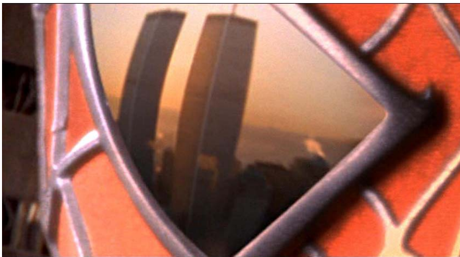
Fig 7: Spiderman (2002) The reflection of the World Trade Center can be seen in Spiderman's eyes in the 2002 release of the film.

Much has been written in technical literature regarding the production of Spiderman as to the creation of its mid town cityscapes and their relationship to the more historic idea of New York. Interestingly, one fleeting scene does remain where the reflection of the World Trade Towers can be clearly seen in Spiderman's eyes – a subtle reference to an architectural element otherwise extraneous to the plot of the film.